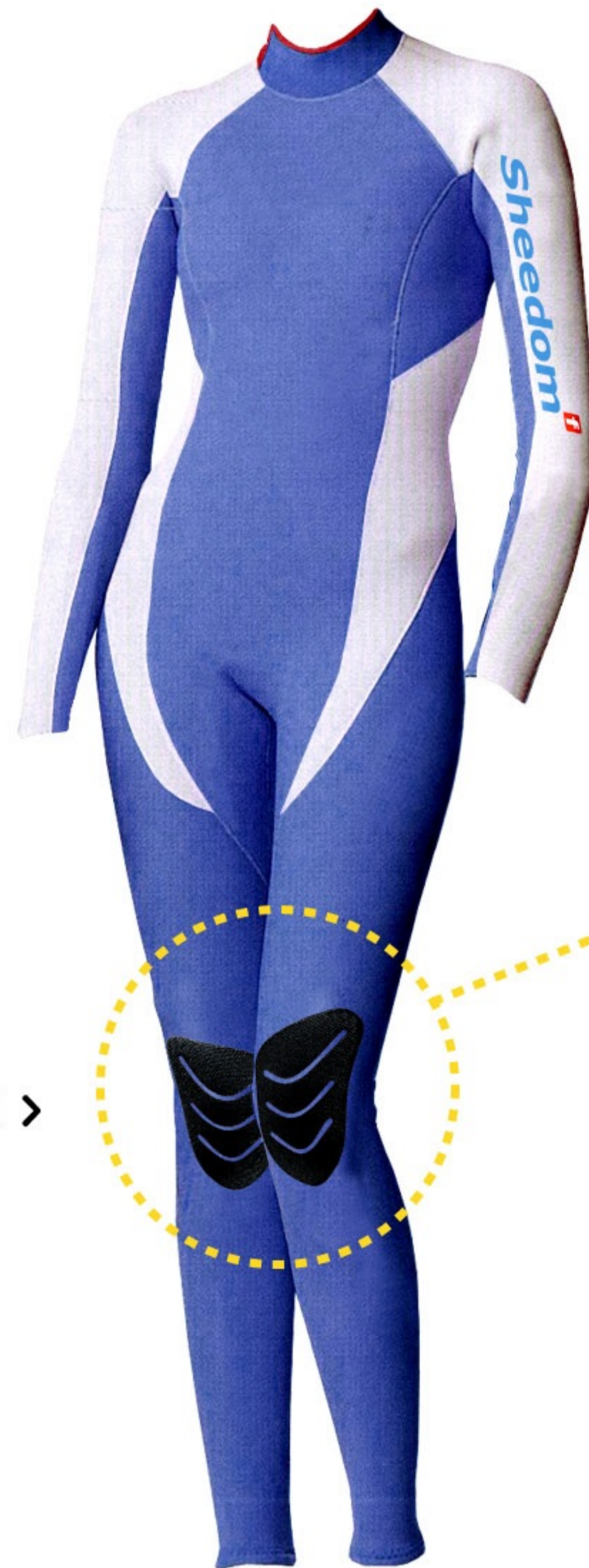
example 1 >